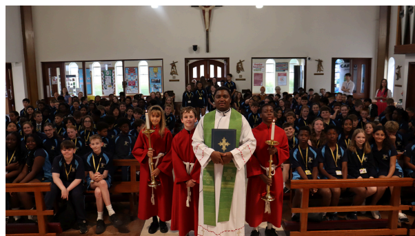
We went on pilgrimage to some of our local parishes for Mass