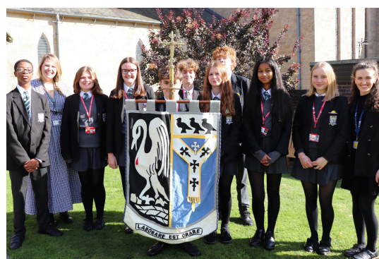
We celebrated the 175th Jubilee Anniversary of the Diocese of Nottingham at St Barnabas Cathedral

Some of our students went on Pilgrimage to Rome with the parish of the Annunciation for the Canonisation of Blessed Carlo Acutis & Blessed Pier Giorgio Frassati