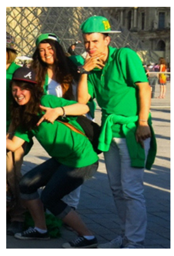
'THE SCHOOL HAS REALLY EMBRACED ITS SPIRITUALITY'